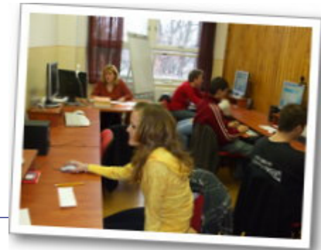
Slovak students during virtual lesson